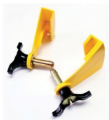
Quick Connect Pins