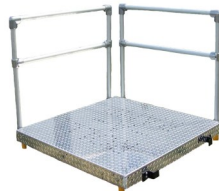
Platform (with handrails and adjustable legs)