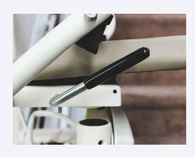
Swivel seat for a safe exit