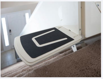
Wide footrests for stability and extra comfort.*

*Wider foot rest vary slightly in style on each Pinnacle model. See model detail for more information.