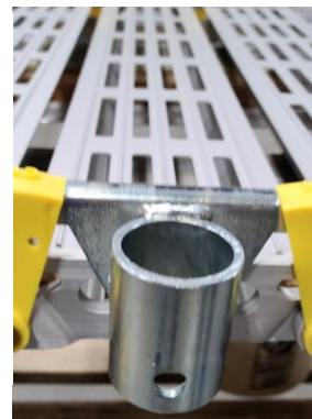
Hook Bracket Attached to Ramp