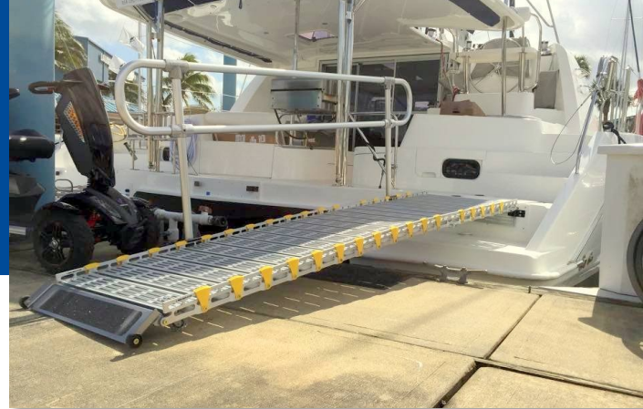
Pictured: 30" x 8' Boat Ramp, 1 handrail w/ Loop-End upgrade and secured with optional Seg-Mount Brackets

Tour boat operators (providing access for customers) Marina operators (providing pier-to-boat access) Watercraft operators (all types)